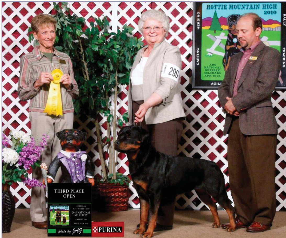
3rd Place - Open Bitches - 2010 ARC National Specialty